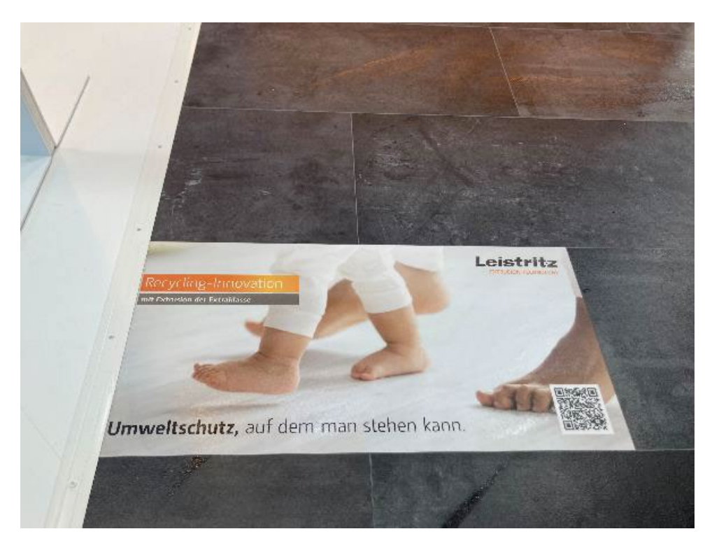
Picture caption: The flooring is robust, recyclable and free of plasticizers.